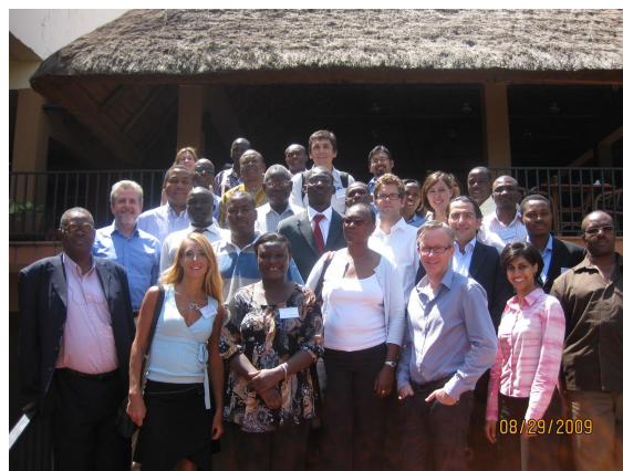
Participants at the first SURE meeting, Kampala, Uganda, 2009

To provide good quality, universal and equitable health care, policymakers need to make well informed decisions about health systems. This necessitates access to and use of reliable research evidence. The SURE (Supporting the Use of Research Evidence) project aims to facilitate policymakers' access to and use of research evidence (including Cochrane reviews) that is relevant, reliable, accessible and timely.